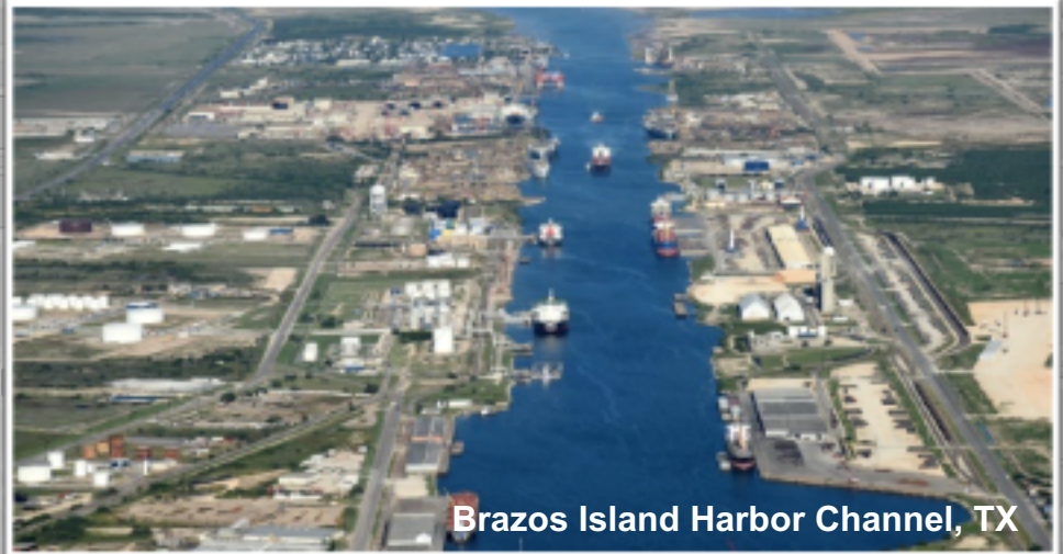
Brazos Island Harbor Channel, TX